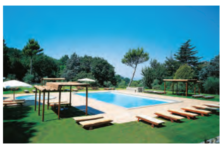
Villa Grazioli, Frascati