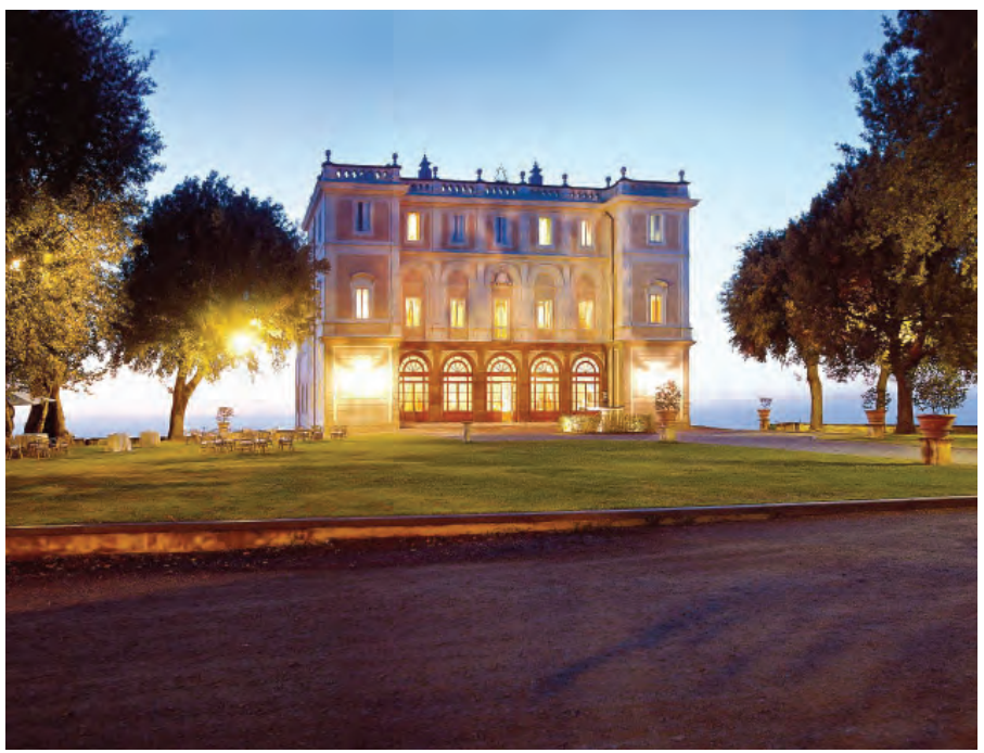
Villa Grazioii, Latium

Donato is adorned with original stained glass dating back to mediaeval times. The Duomo itself is an imposing building, grand despite its minimalist exterior detail, with a warm regal charm that suits the Arezzo style. For wine-tasting opportunities, head out into the neighbouring villages. The Villa la Ripa, for example, is a grand private home, surrounded by vineyards that fuel the independent, family business. The Villa offers vineyard tours, tasting sessions, and an opportunity to pick up some aromatic Tuscan souvenirs. To further escape the tourist spots, head into Cortona, Aghiari, or Monterchi on the hunt for the local goat's cheese or Florentine steak.