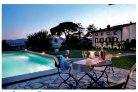
Villa Belpoggio, Tuscany