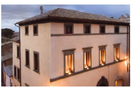
Palazzo Piccolomini, Orvieto

A charming boutique hotel in the Chianti region, Relais Villa Belpoggio boasts an authentic Tuscan style within refined landscaped gardens. Surrounded by olive groves, these gardens are characterised by pristine lawns and rose bushes, while expansive views typify the region, looking over the Pratomagno woods, the Chianti Mountains and the Arno Valley. The elegant mansion itself dates back to the 17th century and its rich history is evident in the antiques that decorate the warm and welcoming interior. Guest accommodation is certainly boutique, with each of the mere 10 guestrooms individually decorated to reflect the uniqueness of each room's dimensions. Some feature exposed stone floors and walls and others offer a distinctly Tuscan feel with terracotta floor tiles, dark wood furniture, log fires and wrought