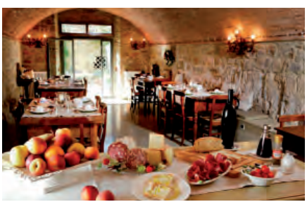
Villa Belpoggio, Tuscany

iron bedsteads. Of the nine double rooms and one Junior Suite, certain room configurations make up apartments suitable for up to six people. This makes Relais Villa Belpoggio an excellent option for families. The restaurant is as authentic as it gets, with exposed stone walls and an arched redbrick ceiling taking a carriage shape. Dine here twice a week and spend your other evenings exploring the number of rustic dining venues in the vicinity. You may also participate in onsite cookery courses, which are a fabulous introduction to regional cuisine. Also within the grounds is a small swimming pool, which is a wonderful place to take in the spectacular scenery, and a small chapel is a characterful addition. The natural environment beyond the estate promises an array of outdoor pursuits to help you get to know the landscape, from horseriding, mountain-biking and trekking. More subdued options include golf, treatments at the thermal spa as well as the onsite cookery courses. Relais Villa Belpoggio is an intimate base for experiencing rural Tuscany, whilst Florence, Siena, and Arezzo are just a daytrip away.