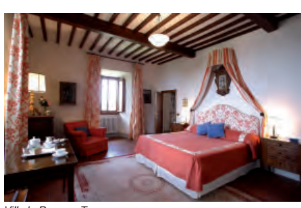
Villa le Barone, Tuscany

overlooking the Hill of Tuscolo. The Limonaia meanwhile offers classically-decorated, garden-facing rooms, whilst Elite rooms are slightly larger and boast wood ceilings. With splendid views over the gardens and towards Rome, the Charme Deluxe rooms and suites are situated in the main building as are the elegant Acquaviva Restaurant, serving a menu of Mediterranean specialities, and the vaulted Eliseo Bar, decorated with reproduction monochromatic stuccos. In summer, the Park Hotel Villa Grazioli's restaurant moves outdoors to the terrace, with wonderful panoramic vistas of the hanging gardens and Rome beyond. There's an inviting outdoor pool in the grounds, with golfing, water sports and a wellness centre all just a short distance away. The Park Hotel Villa Grazioli offers a complimentary shuttle service to and from Frascati railway station, where direct services run to Rome Termini station, bringing the multitude of treasures of the Eternal City within easy touching distance. All in all, a traditional and historical hotel tranquilly situated amidst the Frascati winelands and Castelli Romani.