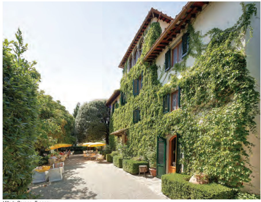
Villa le Barone, Tuscany

iron bedsteads. Of the nine double rooms and one Junior Suite, certain room configurations make up apartments suitable for up to six people. This makes Relais Villa Belpoggio an excellent option for families. The restaurant is as authentic as it gets, with exposed stone walls and an arched redbrick ceiling taking a carriage shape. Dine here twice a week and spend your other evenings exploring the number of rustic dining venues in the vicinity. You may also participate in onsite cookery courses, which are a fabulous introduction to regional cuisine. Also within the grounds is a small swimming pool, which is a wonderful place to take in the spectacular scenery, and a small chapel is a characterful addition. The natural environment beyond the estate promises an array of outdoor pursuits to help you get to know the landscape, from horseriding, mountain-biking and trekking. More subdued options include golf, treatments at the thermal spa as well as the onsite cookery courses. Relais Villa Belpoggio is an intimate base for experiencing rural Tuscany, whilst Florence, Siena, and Arezzo are just a daytrip away.