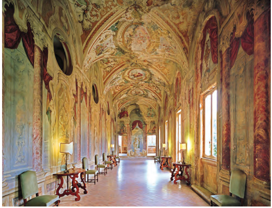
Villa Grazioli, Frascati